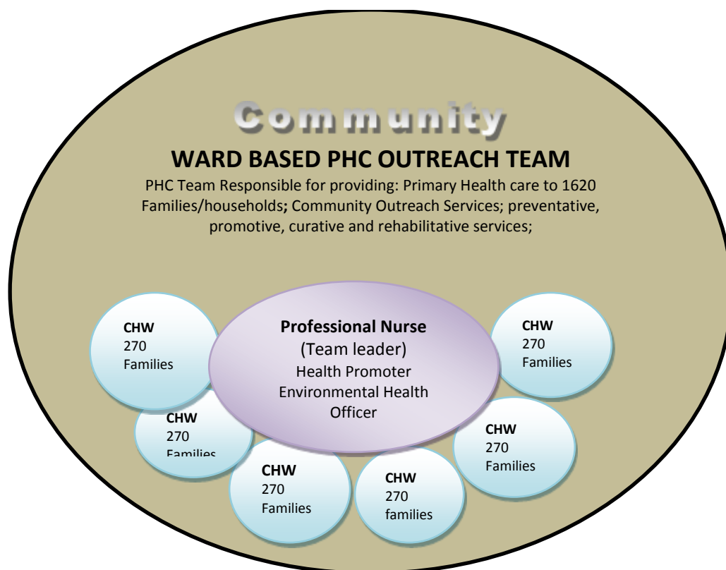
Figure 1 Ward Based PHC Outreach Services

The PHC outreach team (Figure 1) which is one stream of the re-engineered PHC model is the level of the health service which will provide services to communities, families and individuals at community-based institutions and at a household level in a ward. This service must be provided services in close association with facility based health services, other sectors and government departments, CBOs and NPOs providing community based services, and local communities. The ward based PHC outreach team is the cornerstone of community based PHC services, which will encompass activities in communities, households and educational institutions, and referral networks with community based providers (Table 1).